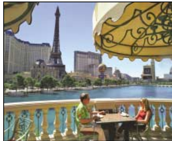
Dining al fresco amid the megahotels on the Strip.

If you want to venture off the Strip, try Rosemary's , a new-American star on the west side; Nobu Matsuhisa's Hard Rock Hotel outlet, Nobu ; the Second Street Grill , at the downtown Fremont Hotel; the San Francisco-inspired Triple George Grill ; or long-time French favorites Alizé , Pamplemousse , or André's (with the downtown location favored over the Monte Carlo Hotel and Casino branch).