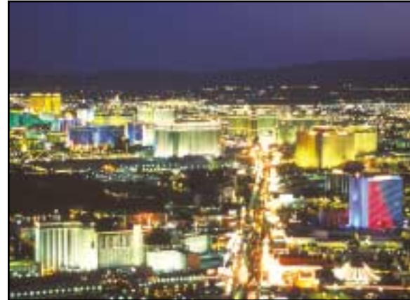
Las Vegas at night.

Although taxis are readily available in the city, cab lines can be long at the hotels. A public bus, operated by Citizens Area Transit (information: 228-7433), runs around the clock on the Strip for $2 one way, and costs somewhat less in other parts of town. The four-mile Las Vegas Monorail (699-8299), traveling from the Sahara Hotel to the MGM Grand Hotel all day except early mornings, is another option on the east side of the Strip; a single ride is $5, and discount ticket books and multiple-day passes are available. Two free mono-