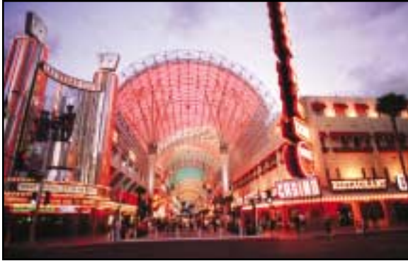
Nightly extravaganza at Fremont Street Experience.

opportunities. Its Bonnie Springs and Old Nevada is a replica of an 1880s mining town, with stables and a petting zoo. Of course, if you'd like to do more traveling, the Grand Canyon and the natural monuments of Utah are a relatively short distance away.