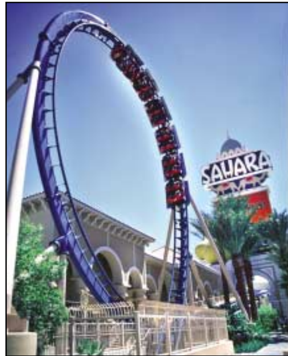
Roller coaster at the Sahara Hotel and Casino.

You can find "tributes" to everyone from Elvis to Liberace around town, but if you're nostalgic for the real thing, try the Temptations and Four Tops at the Stardust Resort and Casino (May 11-13 only); the Platters, Coasters, and Drifters at the Sahara Hotel and Casino ; Blood,