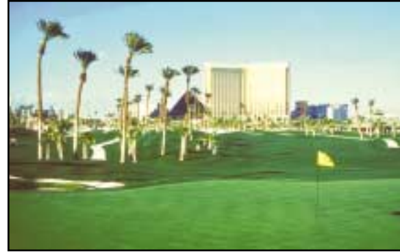
Golf near the Strip at Bali Hai Golf Club.

Also on the Strip, the Fashion Show Mall is home to Dillard's, Macy's, Neiman Marcus, Nordstrom, Robinsons-May, and Saks Fifth Avenue. The Fremont Street Experience is a pedestrian mall designed to bring visitors into the