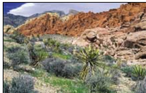
Desert scenery at Red Rock Canyon.

If you’d like to get away from the bright lights and explore the magnificent surrounding desert, the mandatory trip is to Hoover Dam near Boulder City (open daily 9 a.m.-5 p.m.). On the way, you can visit the Ethel M Chocolates Factory and Cactus Gardens and the Boulder City/Hoover Dam Museum . Also nearby are the Lost City Museum of Archaeology and Valley of Fire State Park in Overton. West of Las Vegas, the Red Rock Canyon National Conservation Area is renowned for its cycling, hiking, and climbing